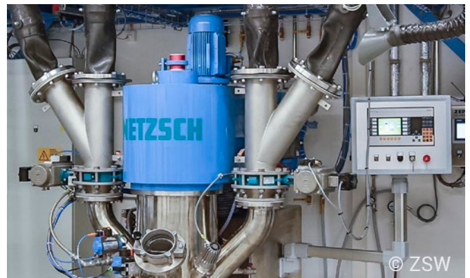
Example slurry mixing plant

With continuous mixing, this process is automated and makes slurry continuously available to the coating systems. Both mixing procedures place stringent requirements on the used components.