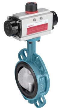
GEMÜ R481 Victoria stainless steel butterfly valve