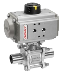
GEMÜ B44 stainless steel ball valve