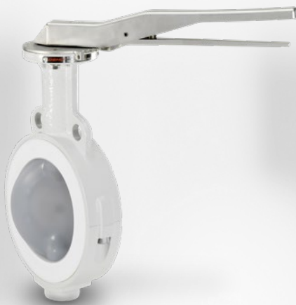
GEMÜ 497 manually operated