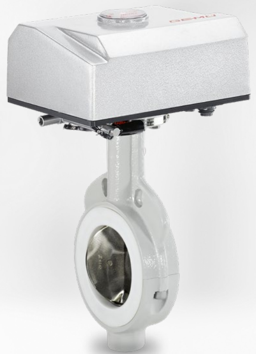
GEMÜ 498 motorized