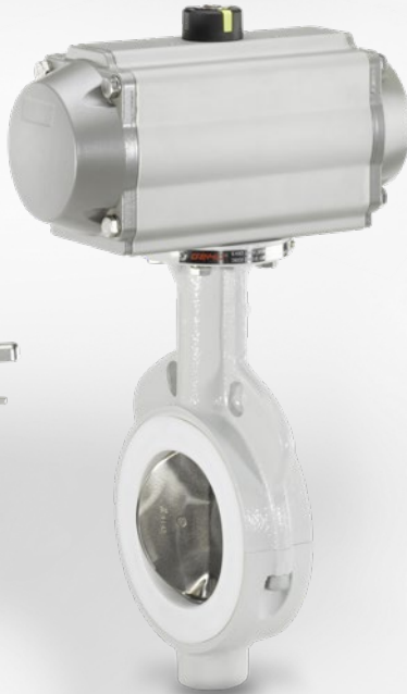
GEMÜ 491 pneumatically operated