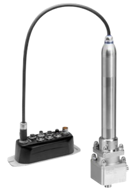
Control valve GEMÜ 567 with GEMÜ 1282 controller